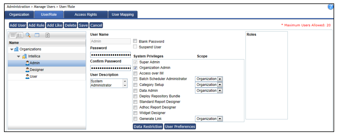
Figure 1: Manage User/Role

In Intellicus 7.0 onwards, Super Administrator can define the scope of System Privileges given to user at the level a) Organization or b) Global.