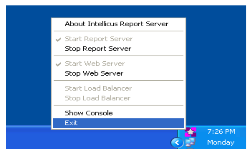
Figure 4: Stop Intellicus Services

Stop Intellicus Report Server and Intellicus Portal if they are running using shortcuts.