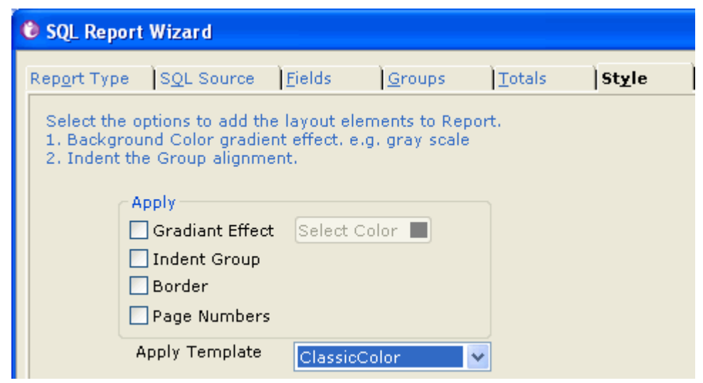
Figure 1: Apply Template on Report Wizard

When you design a report layout with Report Wizard, you might have noticed Apply Template dropdown box on the Style tab.