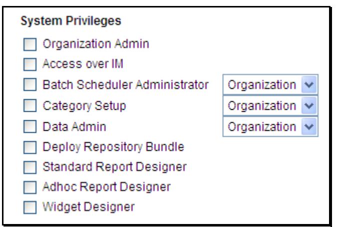
Figure 9: System Privileges for User